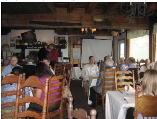
Meeting attendees enjoy a tasty buffet at 94 th Aero Squadron