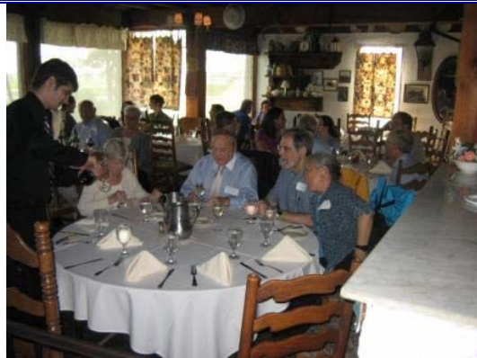
May, 2011 Section meeting attendees enjoy the World-War I era French-farmhouse ambience of the 94th Aero Squadron.