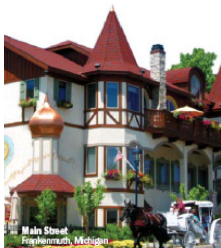
Main Street Frankenmuth, Michigan